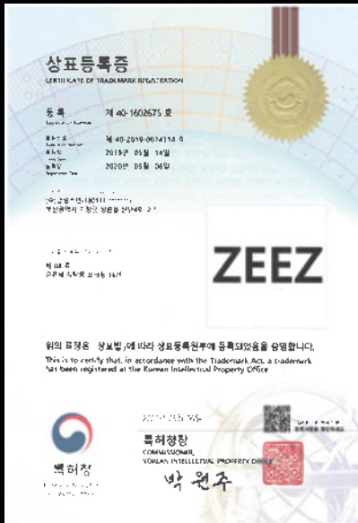
Trademark registration certificate

We develop products that can be used reliably with tireless research and verified technology.